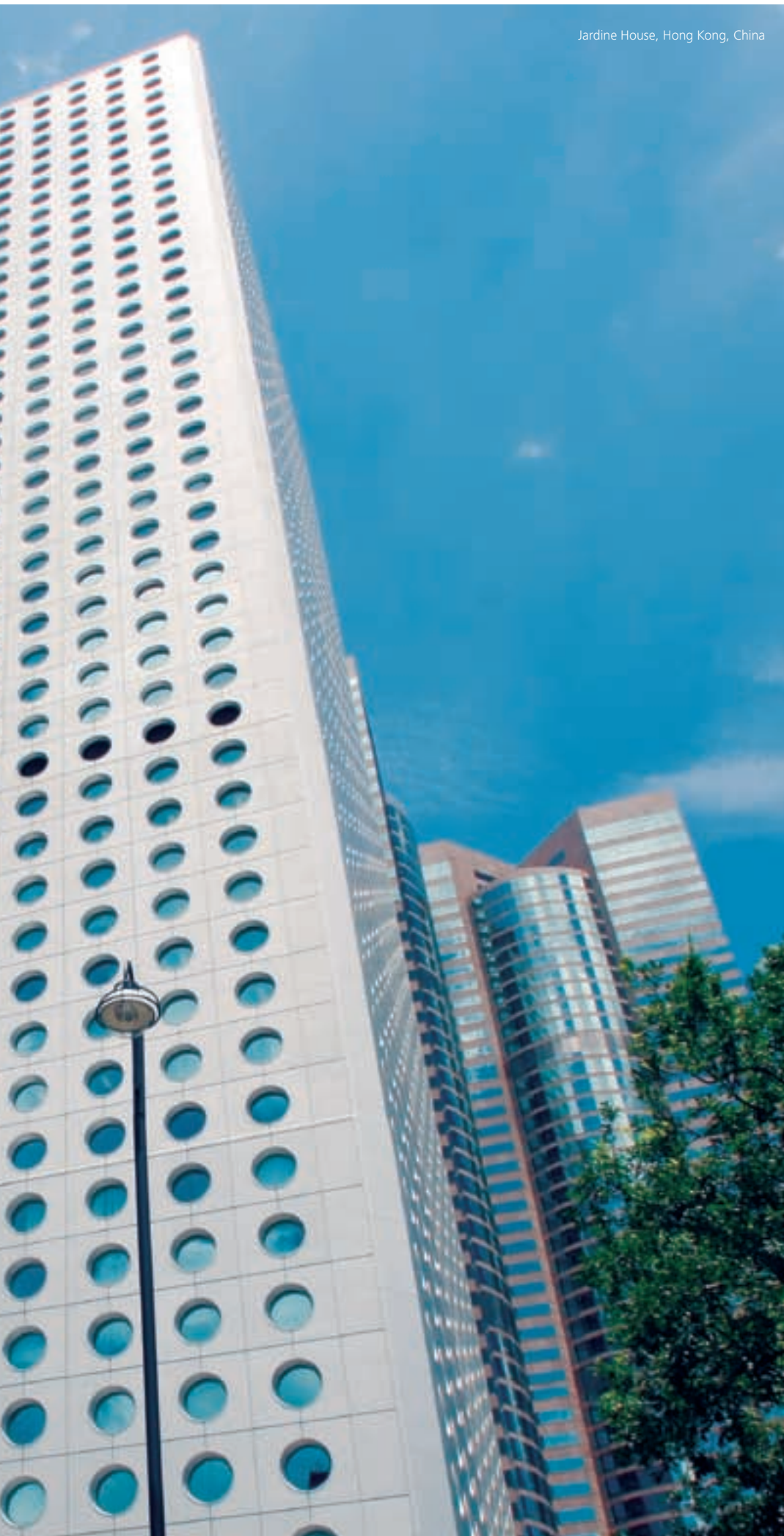
Jardine House, Hong Kong, China